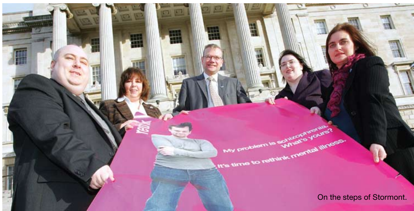
On the steps of Stormont.

although it was least effective with the specified target group, over 35s. The poster messages were not piloted and it is therefore very hard to tell whether these messages were effective.