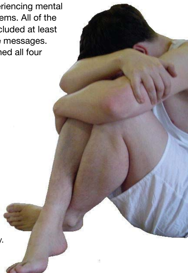
Revolving Door play.

The campaign achieved 65 media mentions during the campaign. Print media was predominantly at a regional level, though there were eight mentions in national papers. There were eight reports in periodicals and 17 mentions in broadcast media. The media coverage was analysed to show how far they included the key campaign messages. 95% included the message that Rethink is working to improve the lives of people with severe mental illness. 89% included the message that stigma is a barrier to recovery, social inclusion and employment. 59% included the figure of 1 in 4 people experiencing mental health problems. All of the coverage included at least one of these messages. 38% contained all four messages.